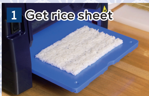
1 Get rice sheet