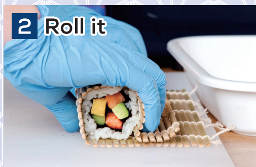
2 Roll it